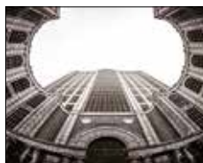
500 Boylston Street, Boston: Rockpoint's HQ

Further capital raising activity in the past few months has elevated Boston-based Rockpoint Group up to 12th position now. Its most recent fund is Rockpoint Real Estate Fund V for which it is targeting around $2.5 billion of equity and has raised nearly $1.5 billion as of press time. Rockpoint will pursue a similar strategy to that of Fund IV, focusing on value creation opportunities and resolving complex situations through the acquisition of primarily office, hotel and multifamily properties in the largest US coastal markets, according to the minutes from US pension New Mexico ERB's investment committee meeting last month. The figure combines for the purposes of the PERE 50 with equity raised in the predecessor funds and $377.8 million in new capital raised through RP NY CIP Investors, a co-investment partnership for the acquisition of 1345 Avenue of the Americas in New York.