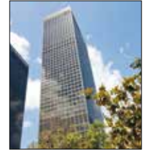
515 South Flower Street, Los Angeles: home to CBRE Global Investors

CBRE Global Investors, part of property services giant CBRE Group, is best known in the higher returning space for its US Value series. CBRE Strategic Partners US Value 6 was closed on $1.1 billion in 2012 lending one third of its total for the PERE 50 ranking. It is now said to be in market with the next fund in the series. In 2013, the Los Angeles-based franchise also secured $360 million for a US opportunistic development fund, CBRE Wood Partners Development Fund 3. The first and second versions were raised in the five-year time frame also. In addition, in 2014 the firm closed on $470 million for its second China focused fund, China Opportunity Fund II.