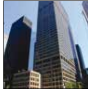
345 Park Avenue, New York: Blackstone's HQ is an equity magnet

Here's a statistic for you. In the past five years, The Blackstone Group has raised more equity for real estate investments than the entire GDP of 77 countries including Haiti, Zimbabwe, Senegal, Honduras, Nicaragua, Iceland and Jamaica. The latest fund has attracted capital commitments of $14.5 billion in less than four months and at press time was expecting another $1.3 billion from high-net-worth investors. Blackstone is also in the market with core funds, but that is not counted for the purposes of this ranking. There is no way any other firm will be ranked number one in this list for years unless Blackstone is taken over or indeed a small country decides to commit its entire GDP to someone else's blind-pool opportunistic real estate fund.