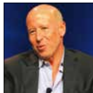
Sternlicht: generation X