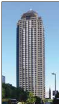
2001 Ross Avenue, Dallas: Invesco's HQ

Invesco is a serious player in the value-added and opportunistic space. The Dallas-based firm has amassed some $3.33 billion for these strategies with the single largest strategy being the Invesco Mortgage Recovery Fund for which it collected $1.465 billion by final close in March 2011. Do not let the name of the fund mislead you. It is a US opportunistic equity fund not a lending fund. The company also raised nearly $350 million for the Invesco Real Estate Value-Add Fund III in June 2013, plus a hotel fund in Europe. It is currently in the market with various value-added and opportunistic strategies, one a global effort, the other two for North America and Asia.