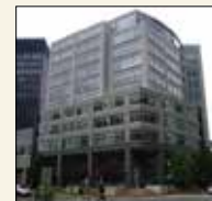
4445 Willard Avenue, Chevy Chase, Maryland: where JBG resides

The JBG Companies, which focuses on urban infill property in the Washington D.C. metropolitan area, ended fundraising for its Fund IX in August 2014. The $680 million raised has been partially put to use, with one of the latest transactions being the creation of a joint venture to invest in Washington D.C. with CBRE Global Investment Partners (GIP), the indirect real estate arm of CBRE Global Investors. Older funds with a 2007, 2010, and 2011 vintage were of similar sizes. Nothing has touched JBG Urban in 2007, however, which closed on $2.5 billion, though that one does not count for this ranking.