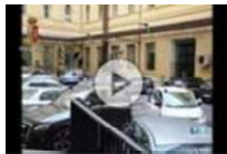
Roman Police Arrest 3 After Tunnel ...