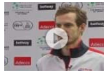
Andy Murray: Being Left Alone with ...