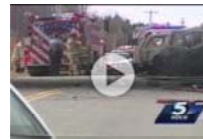
Police Investigating Cause of Aubre...